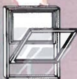
CVD-200 Double Hung

The VERSATILE Crystal Series 200 Fully Welded Vinyl Line is also available in a full collection of styles, sharing many similar features.