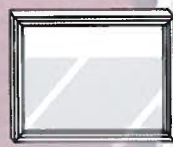
CVP-210 Fixed / Picture