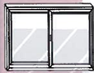
CVS-220 2 Lite or 3 Lite Slider