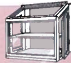
CVG-270 Garden Bay