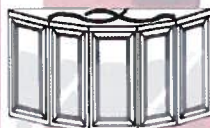
Bays & Bows