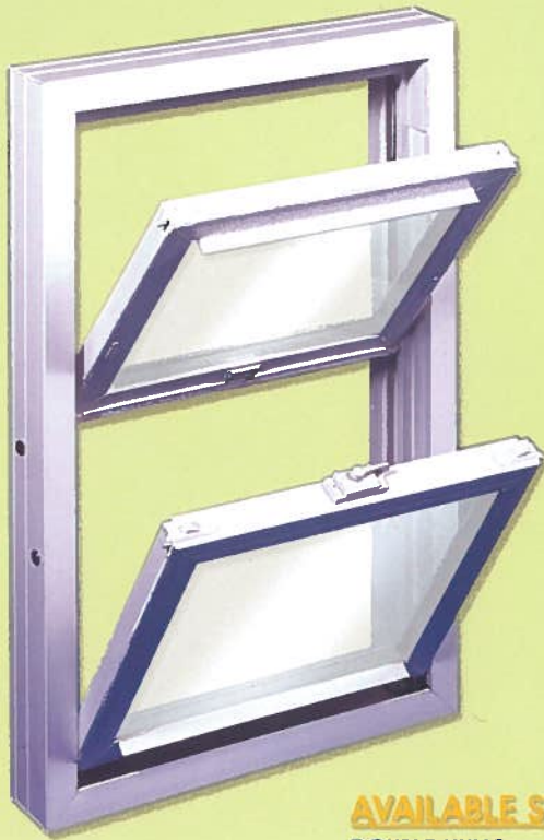
AVAILABLE STYLE: DOUBLE HUNG